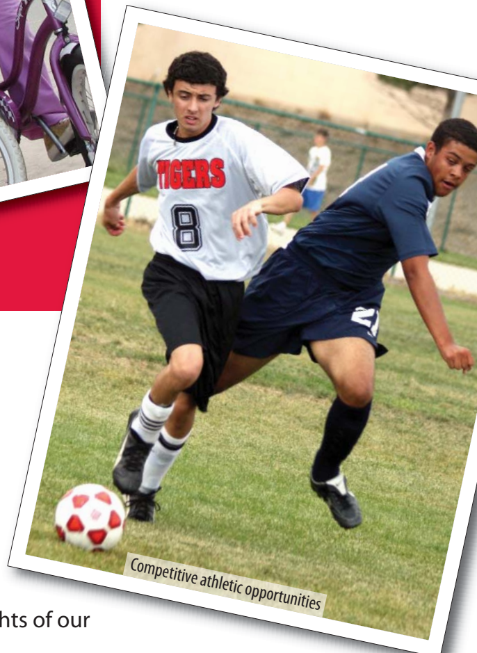
Competitive athletic opportunities

As Denver's only community, K-12 Jewish day school, Denver Jewish Day School (Denver JDS) offers a unique model for wisdom and achievement by integrating high-quality college preparatory and Jewish education in an individualized, supportive environment.