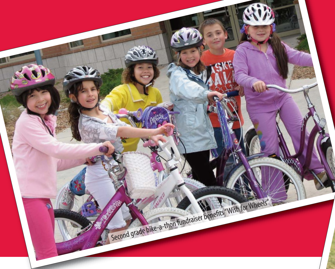
Second grade bike-a-thon fundraiser benefits "Wish for Wheels"